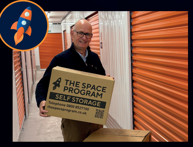
Come and have a look around.