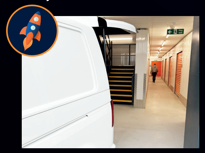
Easy access to your unit.