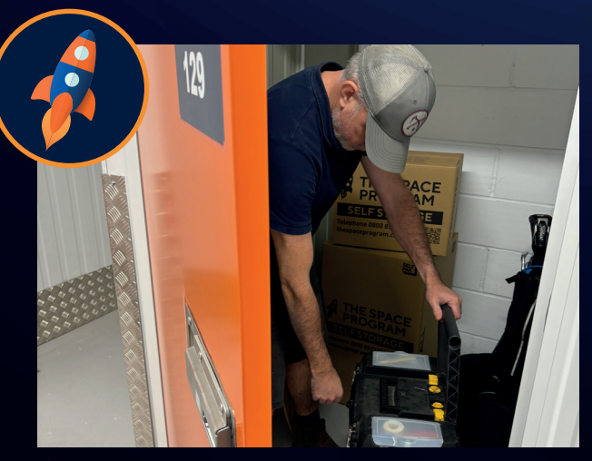
Storage for home and business.