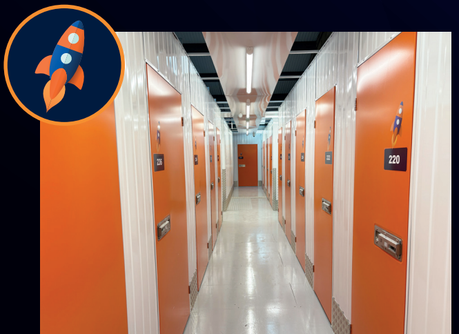
A wide range of unit sizes to suit your individual needs.