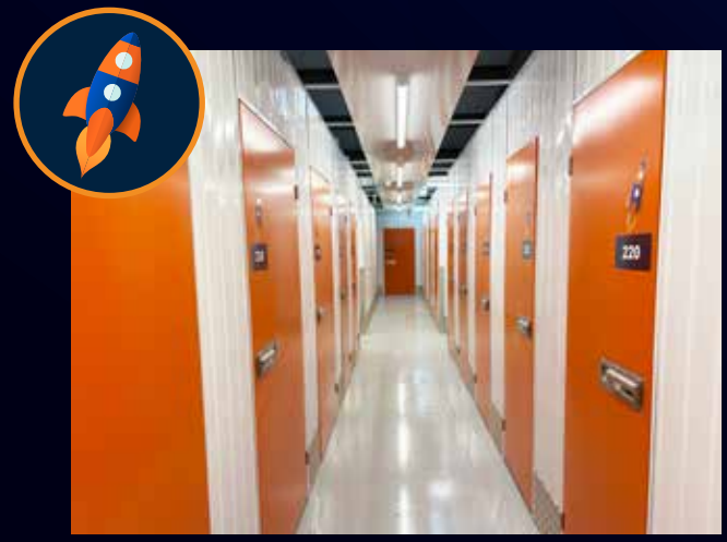
A wide range of unit sizes to suit your individual needs.